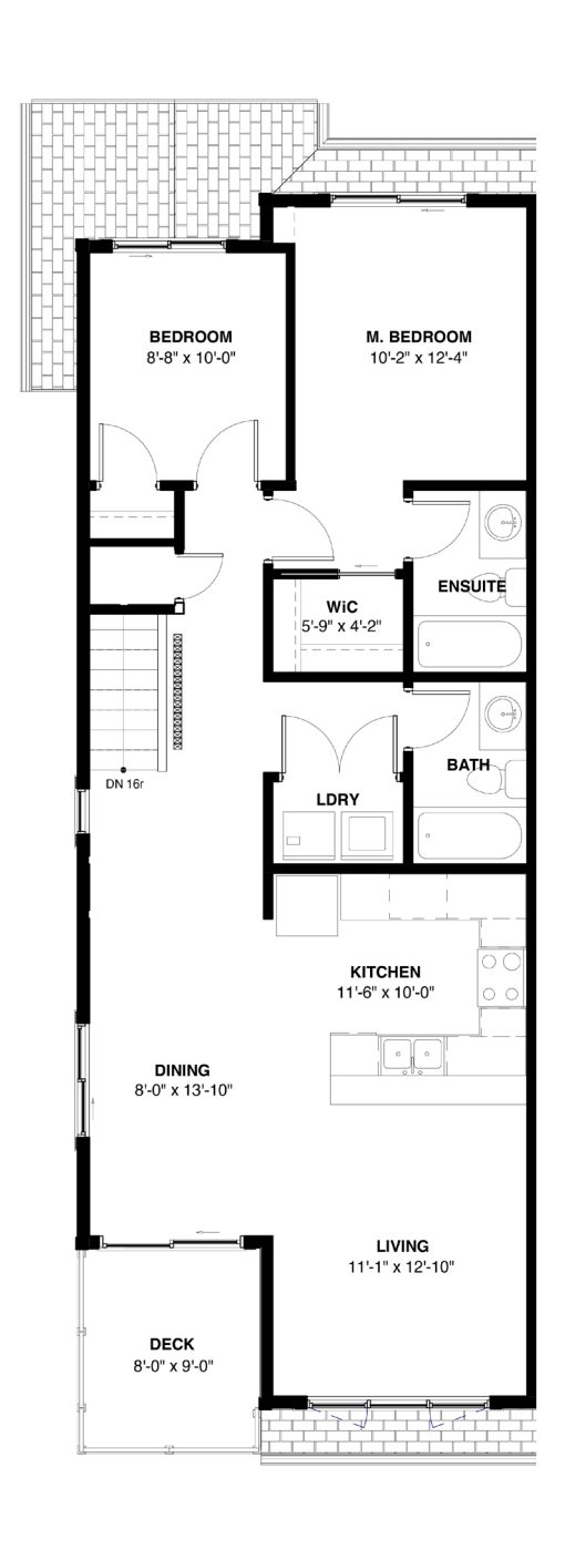
second floor 998 SQ.FT.