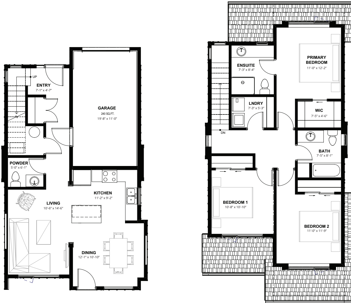
main floor 659 SQ.FT.