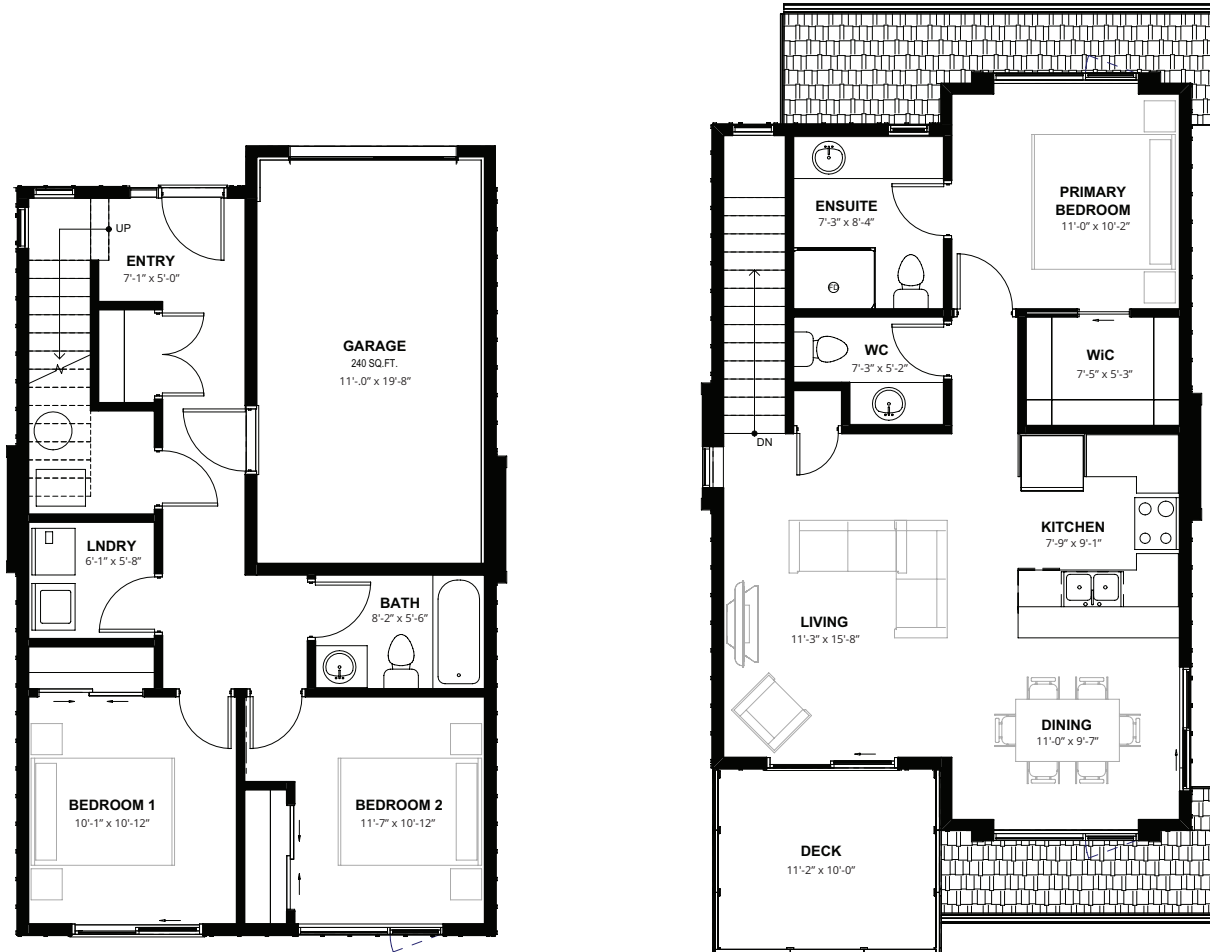
main floor 612 SQ.FT.

SPARTAN B 1,384 SQ.FT. 2 BEDROOM | 3 BATH